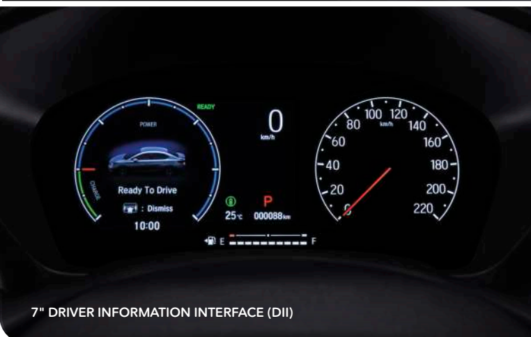
7" DRIVER INFORMATION INTERFACE (DII)